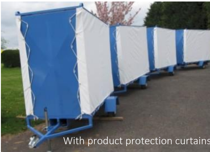
With product protection curtains